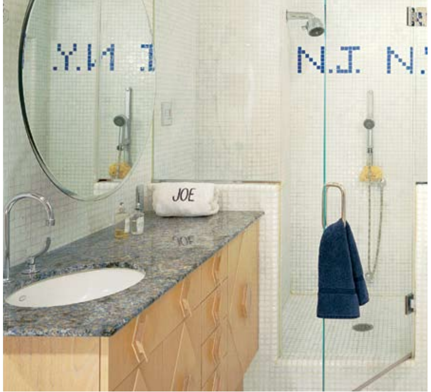
TUNNEL VISION: Joe Smukler’s bathroom is tiled to look like the Lincoln Tunnel because of the amount of time the couple spends traveling between Philadelphia and New York.

The apartment doesn’t have a single painted surface; instead, wood paneling, grass cloth and silk soften the walls. “I always loved paneling,” says Connie, “and wood became a natural finish.” Pale, exotic woods encase the walls and floors: Japanese tamo in the bedroom, English sycamore in the living area, anigre in the kitchen. For Connie, the texture of their fine grains is the artwork